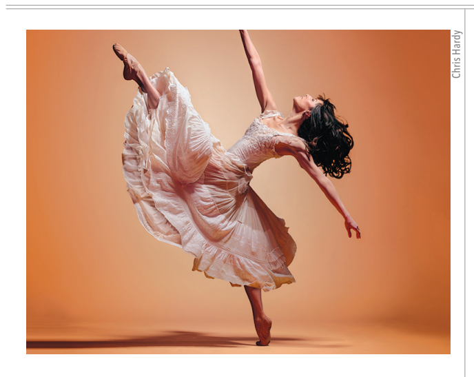
Smuin Contemporary Ballet